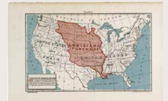
Image Source: https://catalog.archives.gov/id/594889 (National Archives) Map of the Louisiana Purchase Territory, 1903

Create a newspaper for residents of the United States that reflects how life has changed in the alternate timeline. Your newspaper should include the following three features: