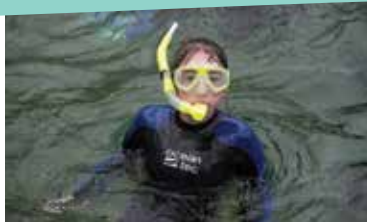
REEF SNORKEL TRIP