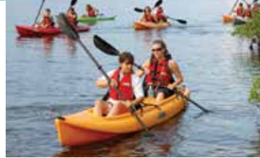
GARDEN COVE KAYAK TOUR