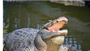
EVERGLADES NATIONAL PARK