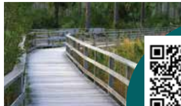
MANGROVE TRAIL HIKE