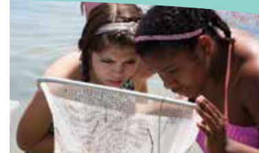
CRYSTAL SPRINGS PRESERVE