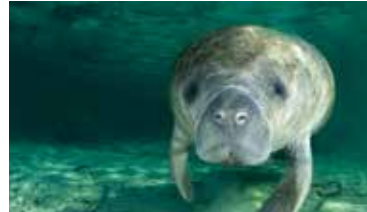
SNORKEL WITH A MANATEE