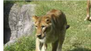
BUSCH GARDENS AFRICAN SAFARI