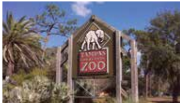
ZOOTAMPA AT LOWRY PARK