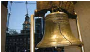
THE LIBERTY BELL