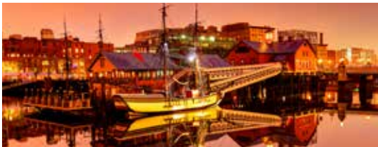
BOSTON TEA PARTY SHIP AND MUSEUM