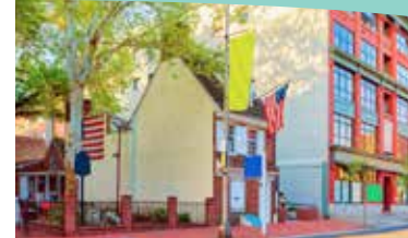
BETSY ROSS HOUSE