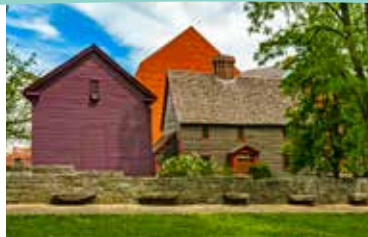
SALEM WITCH MUSEUM