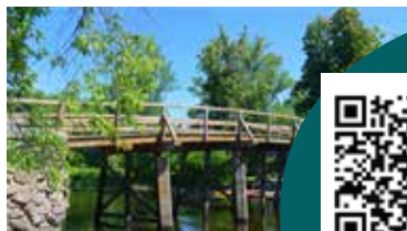
LEXINGTON & CONCORD