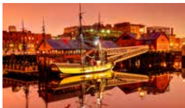
BOSTON TEA PARTY SHIP AND MUSEUM