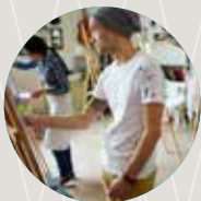
Arts & Fashion