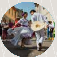
History & Heritage