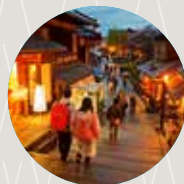
Music & Dance