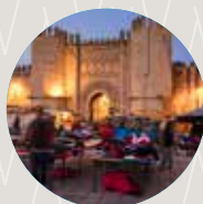
Culture & Tradition