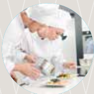
Food & Cuisine